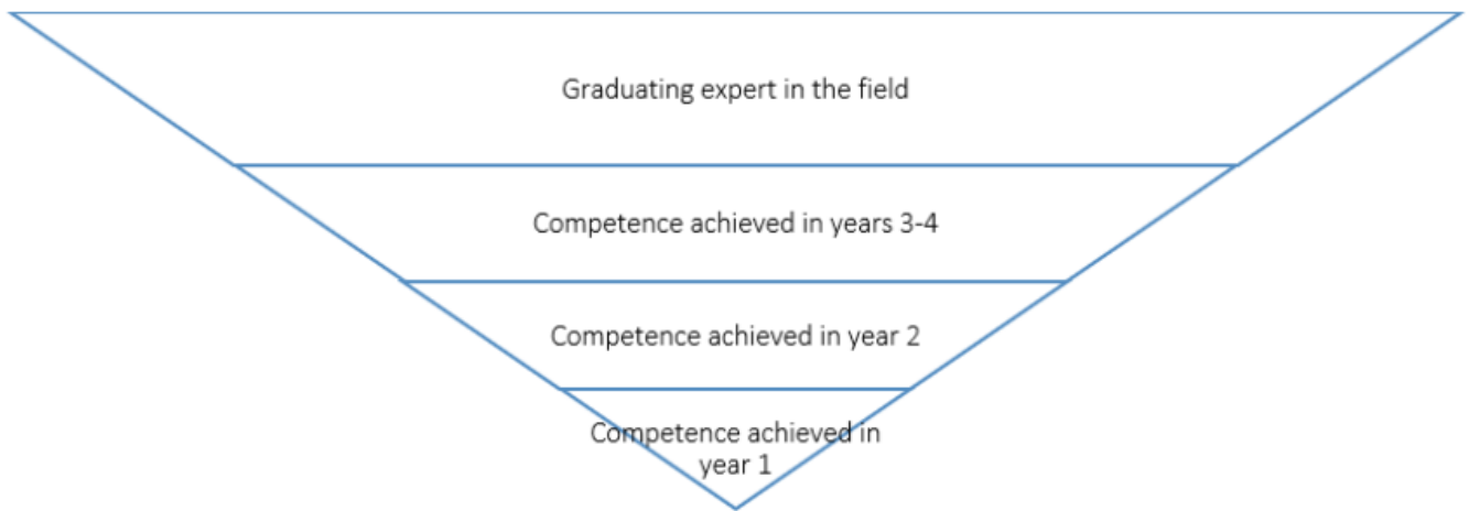
Figure 2. Accumulation of competence

As the studies progress, competence is accumulated so that the learning outcomes set for the degree programme are achieved upon graduation, both in terms of the common competence and the degree-specific, expert core competence (Figure 2).