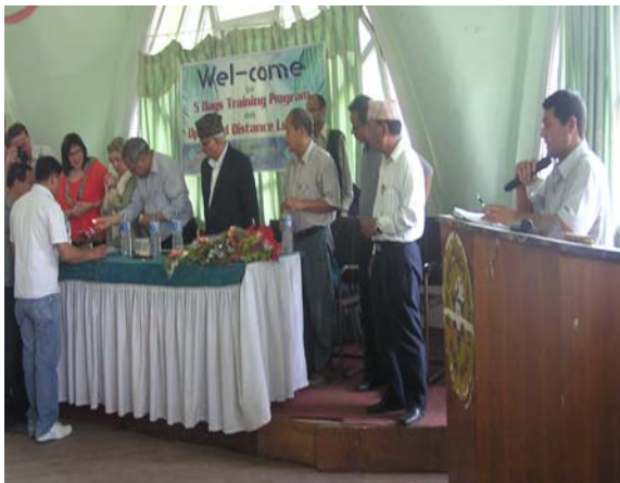
First day of the first phase ToT May 2013

With the end of a decade long civil war, abolition of monarchy and growing awareness of the importance of education, expectations and demand for quality public education have significantly increased in Nepal. Being aware of the expectations, the Government of Nepal declared to achieve the goal of Education for All (EFA) by 2015. In order to meet the challenges in the path of EFA, the Ministry of Education (MoE) took initiative to improve the existing educational services by introducing School Sector Reform Programme (SSRP) 2009-2015. One important component of SSRP is teachers' professional development without which no education reform can be effective.