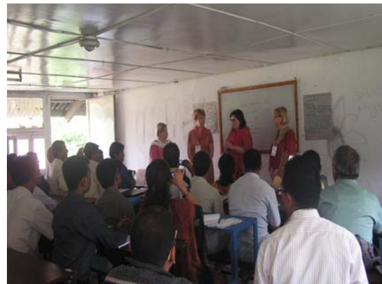
Finnish tutors and Nepali participants

The training was based on participatory approach. Trainees worked on their own in groups and pairs with the constant help and support from the trainers. They discussed the issue and reached the conclusion facilitated by the trainers. At the end of most sessions, different groups made their presentations for other groups in order to get feedback.