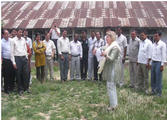
The Finnish tutor talking with the participants

So far, the first and the second phase training on ODL methodology has already been completed successfully in May and in November 2013, and the study visit was completed in October 2013. The establishment of ICT hub and preparation of the SLMs are in progress.